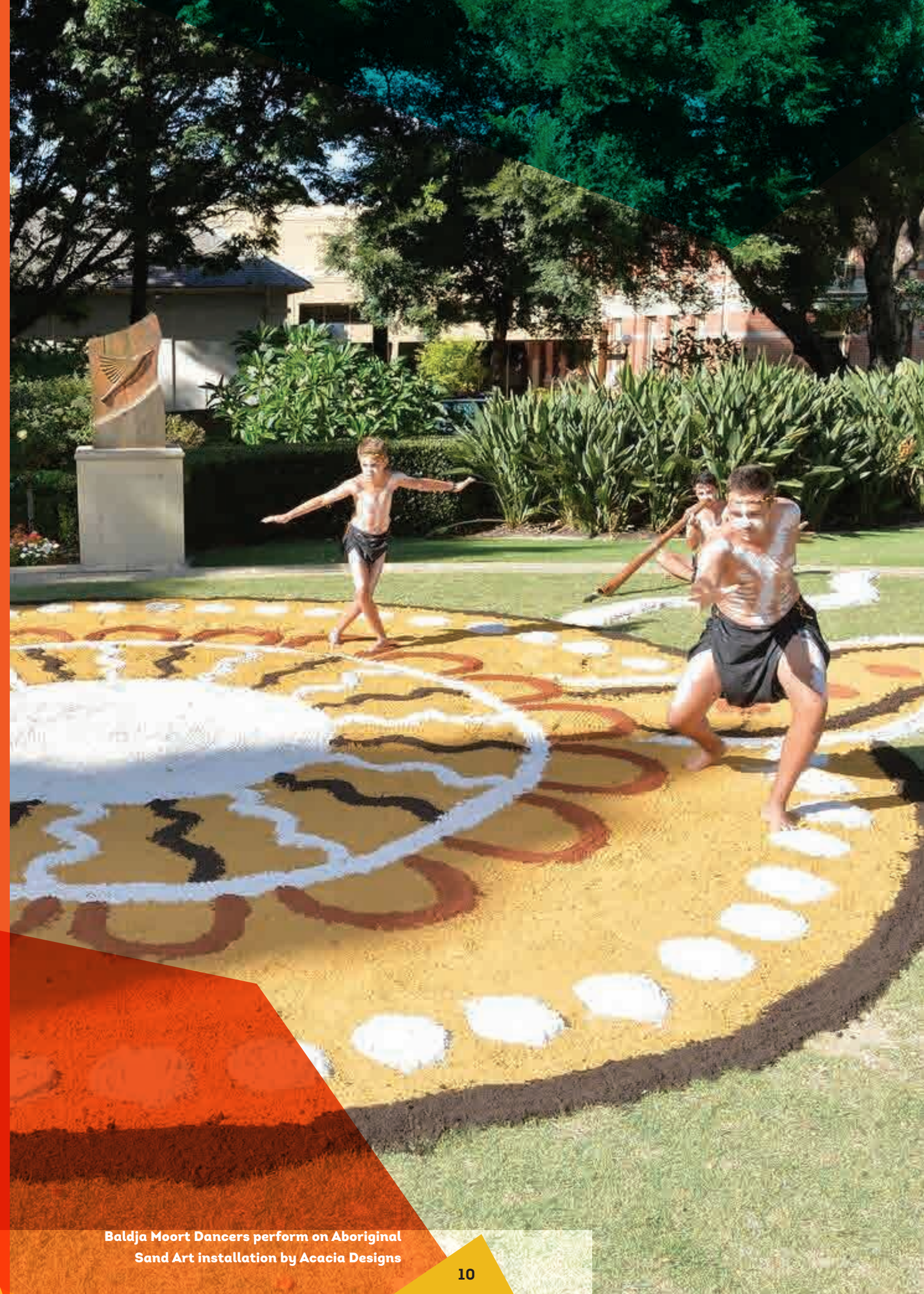
Baldja Moort Dancers perform on Aboriginal Sand Art installation by Acacia Designs